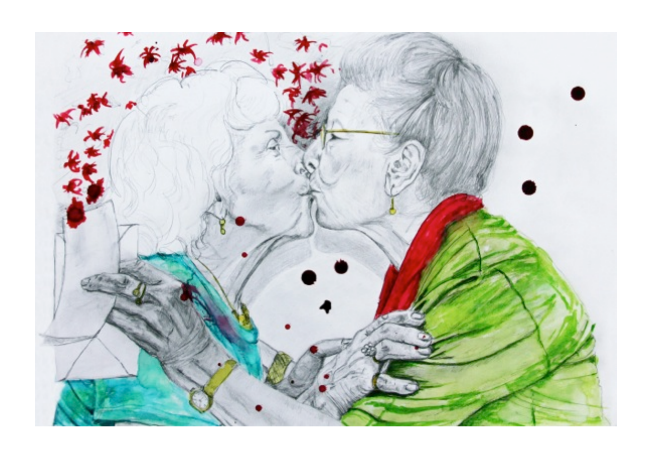
6. As Far As Conversation Is Concerned, © 2011, 17 x 14 inch