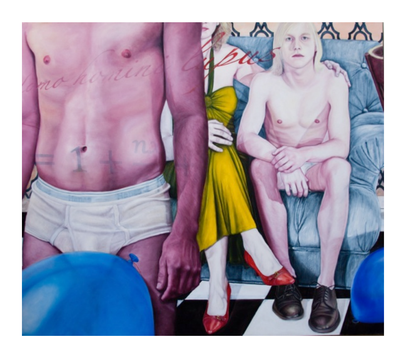
7. An Austrian Adolescence, © 2012, 140 x 60", Oil on Canvas