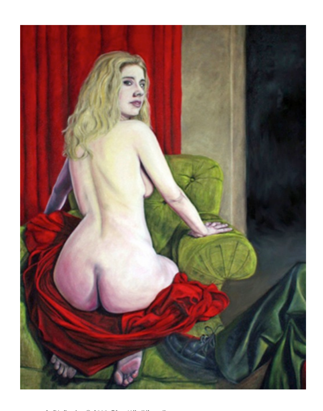
2. Big Brother, © 2008, 72 x 60", Oil on Canvas