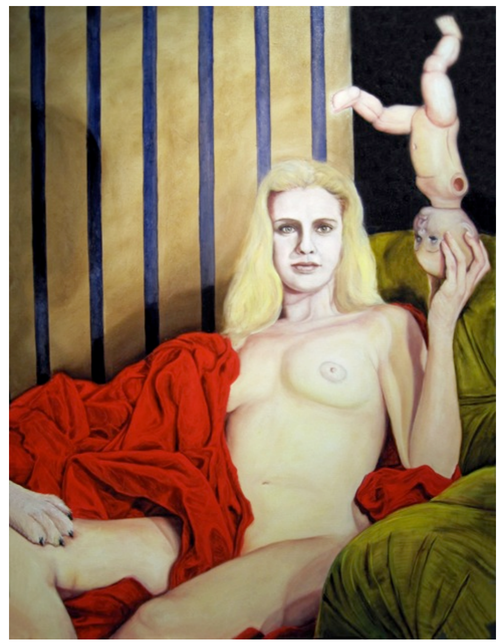
5. Red Riding Hood, © 2010, 48 x 36", Oil on Canvas